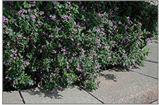
Leptodermis in bloom

This shrub does best in full sun to partial shade. It prefers to grow in average to moist conditions, and shouldn't be allowed to dry out. It may require supplemental watering during periods of drought or extended heat. It is not particular as to soil type or pH. It is somewhat tolerant of urban pollution. This species is not originally from North America.