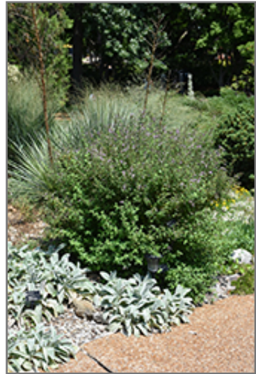
Leptodermis in bloom