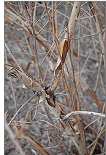
Diablo Ninebark bark

This shrub does best in full sun to partial shade. It is very adaptable to both dry and moist locations, and should do just fine under average home landscape conditions. It may require supplemental watering during periods of drought or extended heat. It is not particular as to soil type or pH. It is highly tolerant of urban pollution and will even thrive in inner city environments. This is a selection of a native North American species.