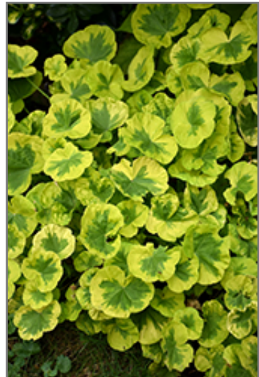
Crystal Palace Gem Geranium foliage