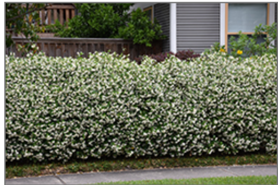
Confederate Star-Jasmine in bloom