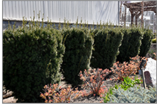
Hicks Yew

This shrub does best in a location that gets morning sunlight but is shaded from the hot afternoon sun, although it will also grow in full shade. Keep it away from hot, dry locations that receive direct afternoon sun or which get reflected sunlight, such as against the south side of a white wall. It does best in average to evenly moist conditions, but will not tolerate standing water. It may require supplemental watering during periods of drought or extended heat. It is not particular as to soil type or pH. It is highly tolerant of urban pollution and will even thrive in inner city environments, and will benefit from being planted in a relatively sheltered location. Consider applying a thick mulch around the root zone in winter to protect it in exposed locations or colder microclimates. This particular variety is an interspecific hybrid, and parts of it are known to be toxic to humans and animals, so care should be exercised in planting it around children and pets.