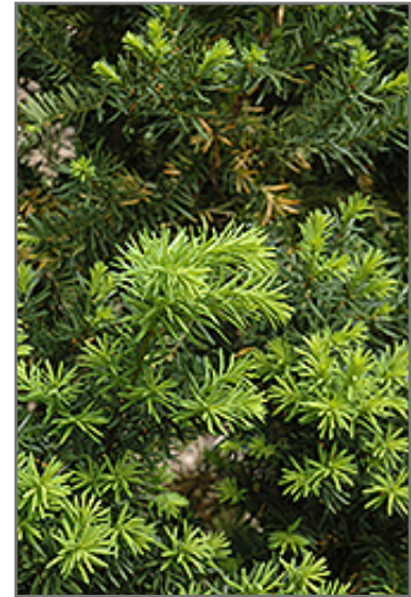
Hicks Yew foliage