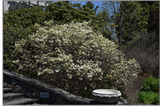
Dwarf Fothergilla in bloom

Dwarf Fothergilla is recommended for the following landscape applications;