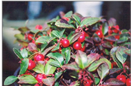
Creeping Wintergreen fruit

Creeping Wintergreen is recommended for the following landscape applications;