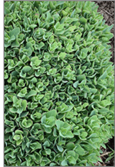
Carl Stonecrop foliage

Carl Stonecrop is a fine choice for the garden, but it is also a good selection for planting in outdoor pots and containers. It is often used as a 'filler' in the 'spiller-thriller-filler' container combination, providing a mass of flowers and foliage against which the larger thriller plants stand out. Note that when growing plants in outdoor containers and baskets, they may require more frequent waterings than they would in the yard or garden.