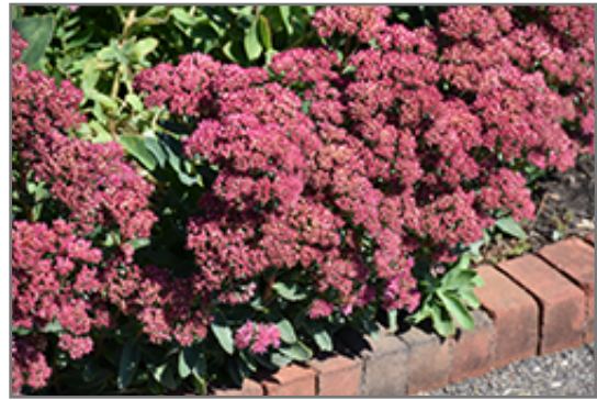
Carl Stonecrop in bloom

This is a relatively low maintenance plant, and is best cleaned up in early spring before it resumes active growth for the season. It is a good choice for attracting bees and butterflies to your yard, but is not particularly attractive to deer who tend to leave it alone in favor of tastier treats. It has no significant negative characteristics.