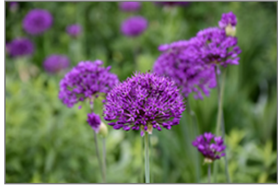
Purple Sensation Ornamental Onion flowers