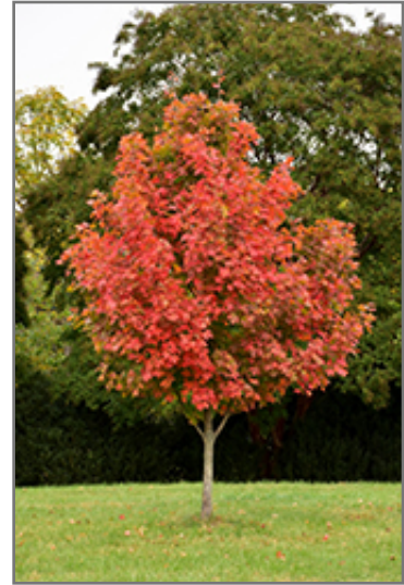
John Pair Sugar Maple in fall