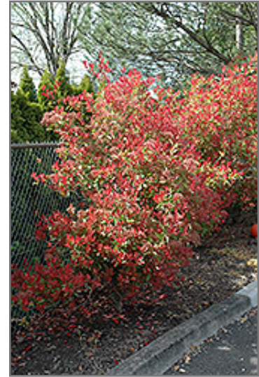
Fraser Photinia in bloom