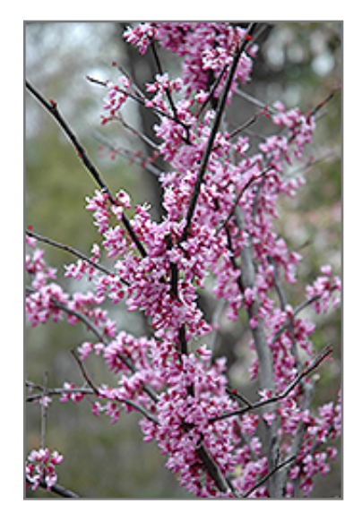
Forest Pansy Redbud flowers