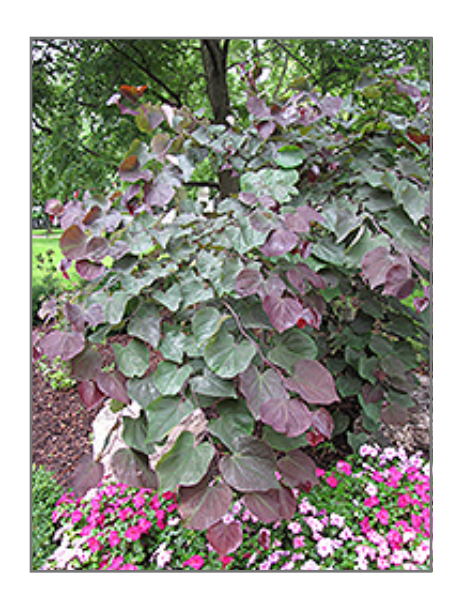
Forest Pansy Redbud foliage

This tree does best in full sun to partial shade. It prefers to grow in average to moist conditions, and shouldn't be allowed to dry out. It may require supplemental watering during periods of drought or extended heat. It is not particular as to soil type or pH. It is highly tolerant of urban pollution and will even thrive in inner city environments, and will benefit from being planted in a relatively sheltered location. Consider applying a thick mulch around the root zone in winter to protect it in exposed locations or colder microclimates. This is a selection of a native North American species.