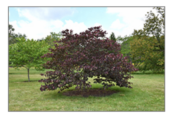
Forest Pansy Redbud

Springdale 1709 North Thompson Springdale, AR (479) 872-9200