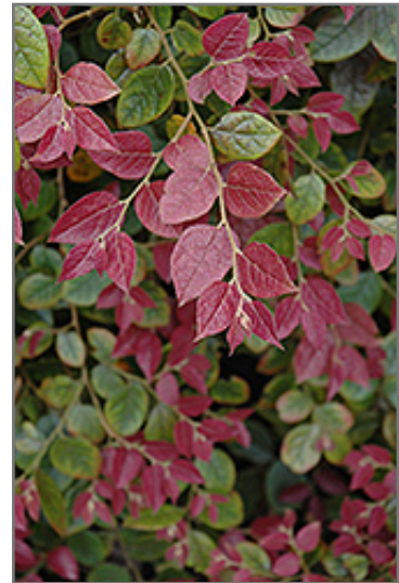
Razzleberri Fringeflower foliage