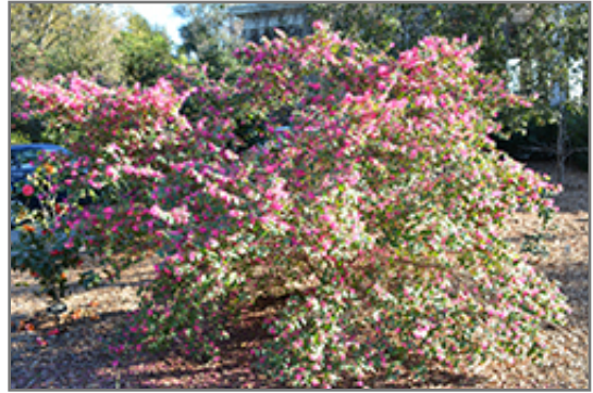
Razzleberri Fringeflower in bloom

This shrub does best in full sun to partial shade. It prefers to grow in average to moist conditions, and shouldn't be allowed to dry out. It may require supplemental watering during periods of drought or extended heat. It is particular about its soil conditions, with a strong preference for rich, acidic soils. It is somewhat tolerant of urban pollution. Consider applying a thick mulch around the root zone in winter to protect it in exposed locations or colder microclimates. This is a selected variety of a species not originally from North America.