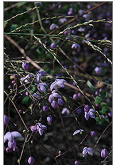
Splendide Meadow Rue flowers