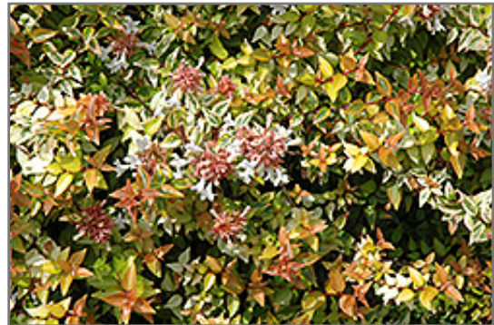
Kaleidoscope Abelia flowers

This shrub will require occasional maintenance and upkeep, and should only be pruned after flowering to avoid removing any of the current season's flowers. It is a good choice for attracting birds, bees and butterflies to your yard, but is not particularly attractive to deer who tend to leave it alone in favor of tastier treats. It has no significant negative characteristics.