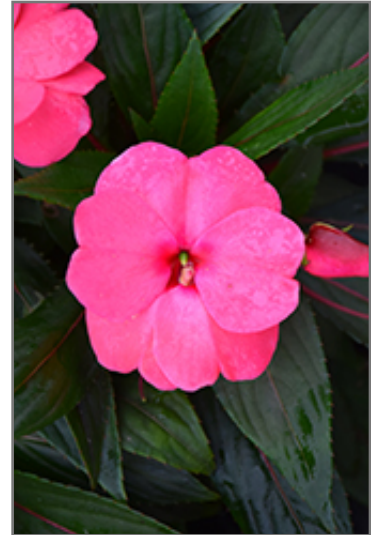
Sonic Pink New Guinea Impatiens flowers

Sonic Pink New Guinea Impatiens is recommended for the following landscape applications;