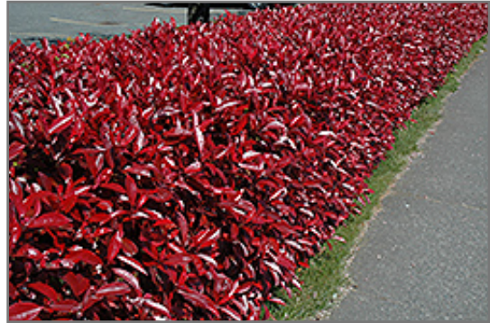
Fraser Photinia

This shrub does best in a location that gets morning sunlight but is shaded from the hot afternoon sun, although it will also grow in full shade. Keep it away from hot, dry locations that receive direct afternoon sun or which get reflected sunlight, such as against the south side of a white wall. It is very adaptable to both dry and moist growing conditions, but will not tolerate any standing water. It may require supplemental watering during periods of drought or extended heat. It is not particular as to soil type or pH. It is highly tolerant of urban pollution and will even thrive in inner city environments. This particular variety is an interspecific hybrid.