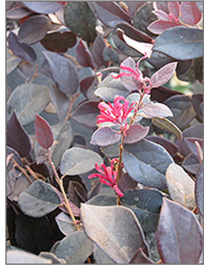
Purple Pixie Fringeflower flowers