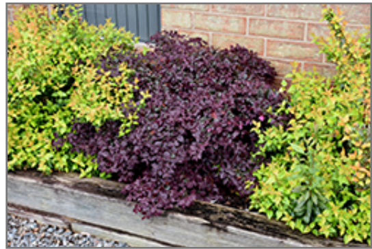
Purple Pixie Fringeflower