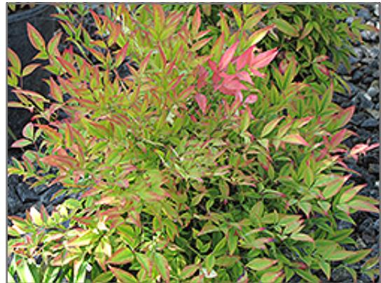
Moon Bay Dwarf Nandina