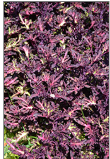
Merlin's Magic Coleus foliage