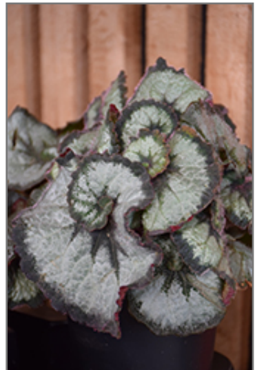
Escargot Begonia foliage