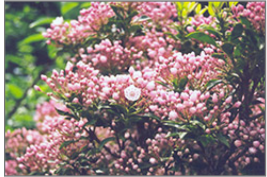
Miniature Mountain Laurel flowers

Miniature Mountain Laurel will grow to be about 6 feet tall at maturity, with a spread of 7 feet. It tends to fill out right to the ground and therefore doesn't necessarily require facer plants in front, and is suitable for planting under power lines. It grows at a slow rate, and under ideal conditions can be expected to live for 50 years or more.