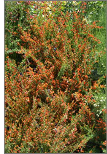
Lena Scotch Broom in bloom

This shrub should only be grown in full sunlight. It prefers dry to average moisture levels with very well-drained soil, and will often die in standing water. It is considered to be drought-tolerant, and thus makes an ideal choice for xeriscaping or the moisture-conserving landscape. It is particular about its soil conditions, with a strong preference for clay, alkaline soils, and is able to handle environmental salt. It is highly tolerant of urban pollution and will even thrive in inner city environments. This particular variety is an interspecific hybrid.