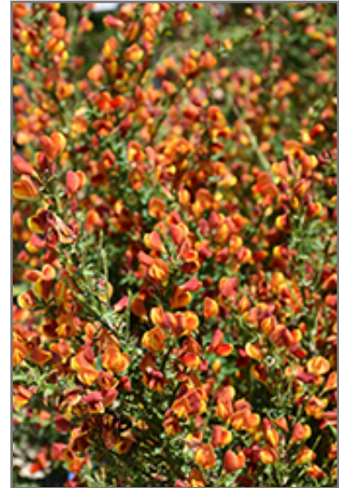
Lena Scotch Broom flowers