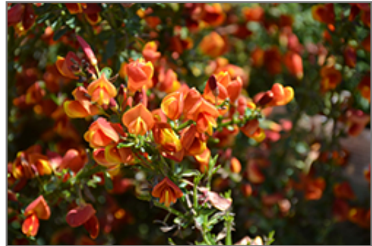
Lena Scotch Broom flowers