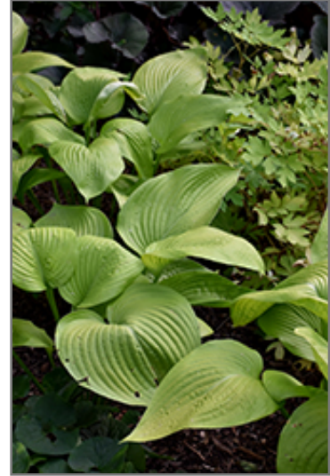
Key West Hosta

This plant does best in partial shade to full shade. Keep it well away from hot, dry locations that receive direct afternoon sun or which get reflected sunlight, such as against the south side of a white wall. It prefers to grow in average to moist conditions, and shouldn't be allowed to dry out. It may require supplemental watering during periods of drought or extended heat. It is not particular as to soil type or pH. It is somewhat tolerant of urban pollution. This particular variety is an interspecific hybrid. It can be propagated by division; however, as a cultivated variety, be aware that it may be subject to certain restrictions or prohibitions on propagation.