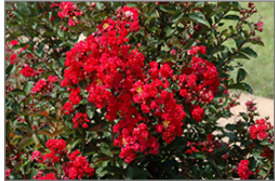
Dynamite Crapemyrtle flowers