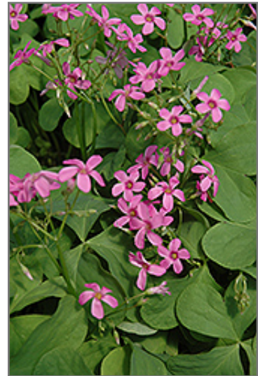
Pink Wood Sorrel flowers