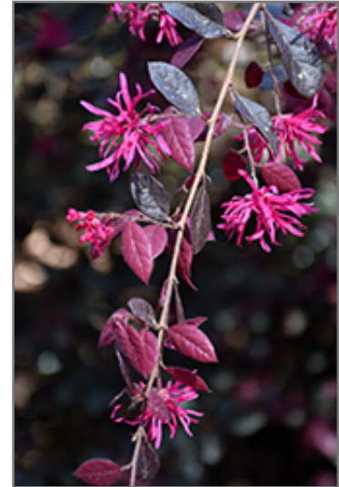
Purple Diamond Fringeflower flowers

Purple Diamond Fringeflower is recommended for the following landscape applications;