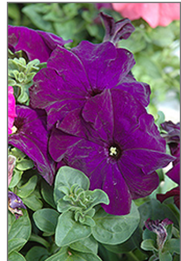
Dreams Midnight Petunia flowers