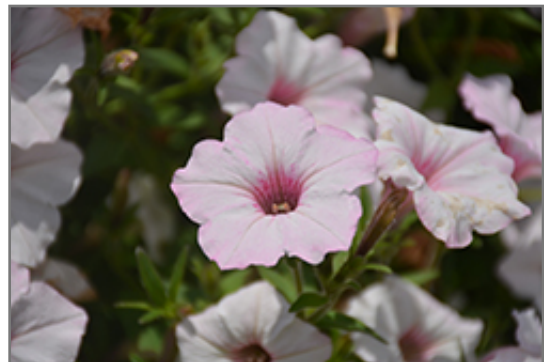
Supertunia Vista Silverberry Petunia flowers