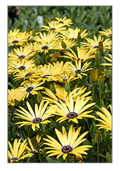
Lemon Symphony African Daisy flowers