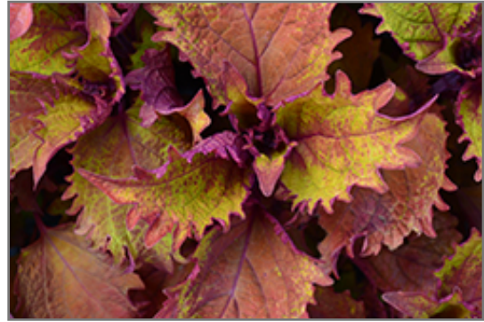
Henna Coleus foliage