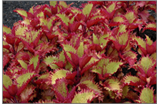
Henna Coleus foliage