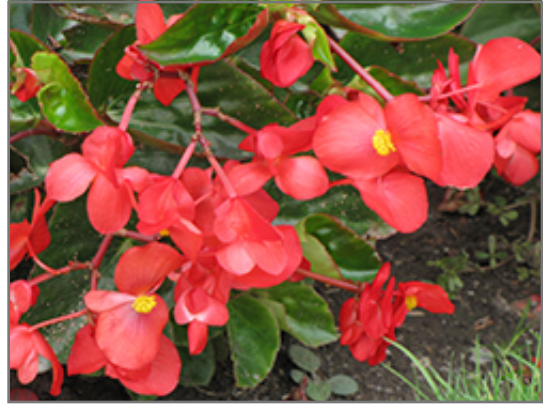
Dragon Wing Red Begonia flowers

Dragon Wing Red Begonia is an herbaceous annual with a trailing habit of growth, eventually spilling over the edges of hanging baskets and containers. Its medium texture blends into the garden, but can always be balanced by a couple of finer or coarser plants for an effective composition.