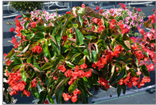
Dragon Wing Red Begonia in bloom

Dragon Wing Red Begonia is a fine choice for the garden, but it is also a good selection for planting in outdoor containers and hanging baskets. Because of its trailing habit of growth, it is ideally suited for use as a 'spiller' in the 'spiller-thriller-filler' container combination; plant it near the edges where it can spill gracefully over the pot. Note that when growing plants in outdoor containers and baskets, they may require more frequent waterings than they would in the yard or garden.