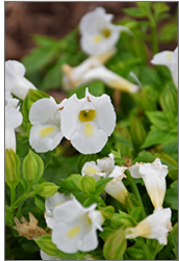
Catalina White Linen Torenia flowers