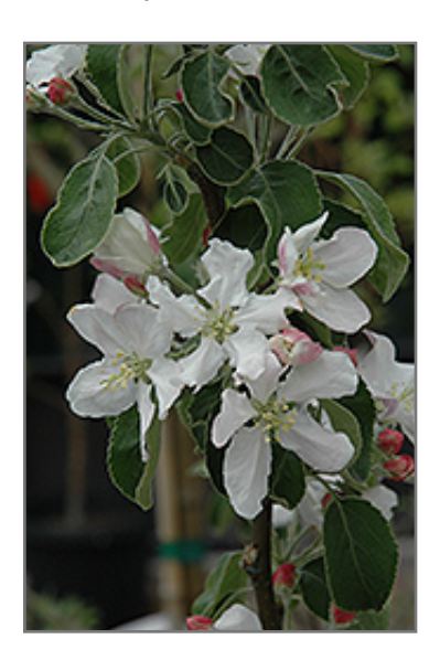
Granny Smith Apple flowers