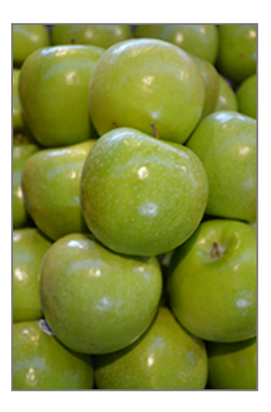
Granny Smith Apple fruit

Granny Smith Apple will grow to be about 20 feet tall at maturity, with a spread of 20 feet. It has a low canopy with a typical clearance of 4 feet from the ground, and is suitable for planting under power lines. It grows at a medium rate, and under ideal conditions can be expected to live for 50 years or more. This variety requires a different selection of the same species growing nearby in order to set fruit.