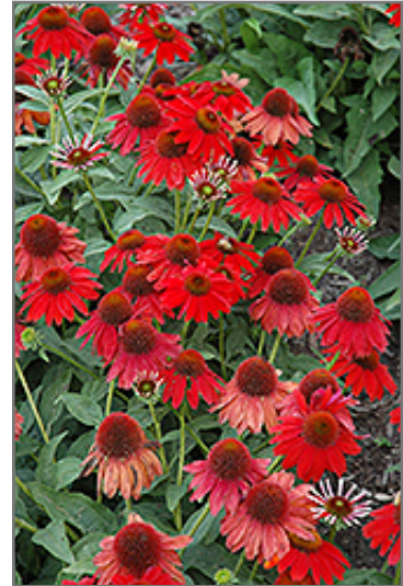
Sombrero Salsa Red Coneflower flowers

Sombrero Salsa Red Coneflower is recommended for the following landscape applications;