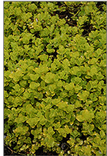
Golden Creeping Jenny foliage

Golden Creeping Jenny is recommended for the following landscape applications;