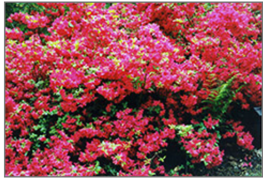
Hino Red Azalea in bloom