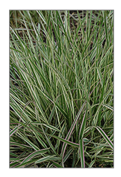
Variegated Reed Grass foliage

West Fayetteville 4324 Wedington Dr. Fayetteville, AR (479) 442-3500