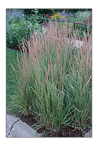
Variegated Reed Grass in bloom

This plant will require occasional maintenance and upkeep, and is best cut back to the ground in late winter before active growth resumes. It has no significant negative characteristics.