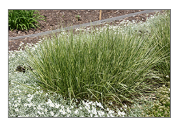
Variegated Reed Grass

Variegated Reed Grass will grow to be about 3 feet tall at maturity extending to 4 feet tall with the flowers, with a spread of 24 inches. It tends to be leggy, with a typical clearance of 1 foot from the ground, and should be underplanted with lower-growing perennials. It grows at a medium rate, and under ideal conditions can be expected to live for approximately 10 years. As an herbaceous perennial, this plant will usually die back to the crown each winter, and will regrow from the base each spring. Be careful not to disturb the crown in late winter when it may not be readily seen!