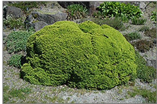
Little Gem Spruce