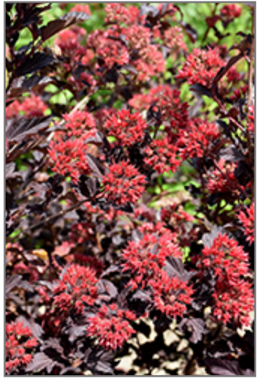
Center Glow Ninebark fruit

This shrub will require occasional maintenance and upkeep, and can be pruned at anytime. It has no significant negative characteristics.