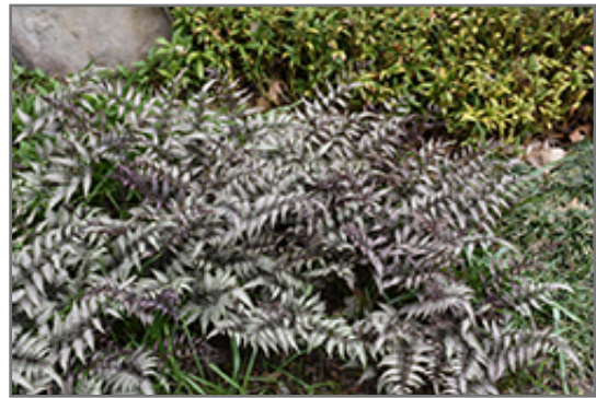
Pewter Lace Painted Fern