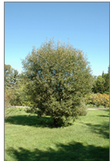
Pussy Willow