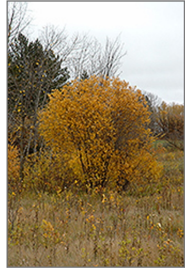
Pussy Willow in fall

This shrub does best in full sun to partial shade. It is quite adaptable, preferring to grow in average to wet conditions, and will even tolerate some standing water. It is not particular as to soil type or pH. It is somewhat tolerant of urban pollution. This species is native to parts of North America.