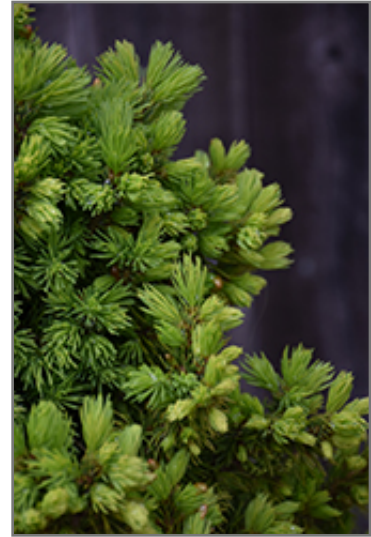
Rainbow's End Spruce foliage

This shrub should only be grown in full sunlight. It prefers to grow in average to moist conditions, and shouldn't be allowed to dry out. It may require supplemental watering during periods of drought or extended heat. It is not particular as to soil type or pH. It is somewhat tolerant of urban pollution, and will benefit from being planted in a relatively sheltered location. This is a selection of a native North American species.