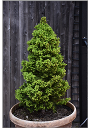
Rainbow's End Spruce