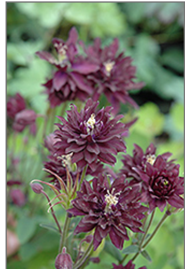
Clementine Dark Purple Columbine flowers