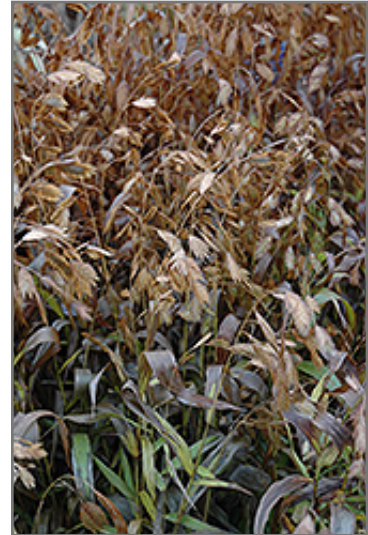
Northern Sea Oats in fall

Northern Sea Oats is recommended for the following landscape applications;