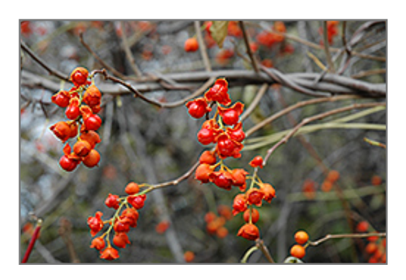
American Bittersweet fruit