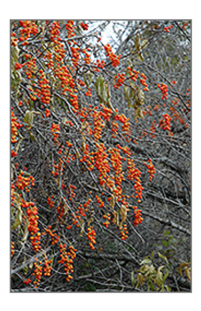
American Bittersweet fruit