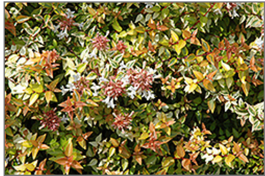
Kaleidoscope Abelia flowers

This shrub will require occasional maintenance and upkeep, and should only be pruned after flowering to avoid removing any of the current season's flowers. It is a good choice for attracting birds, bees and butterflies to your yard, but is not particularly attractive to deer who tend to leave it alone in favor of tastier treats. It has no significant negative characteristics.