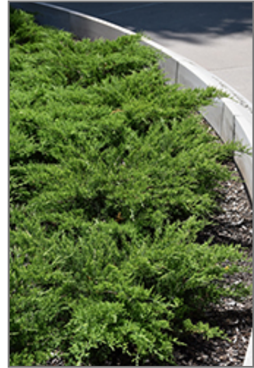
Broadmoor Juniper