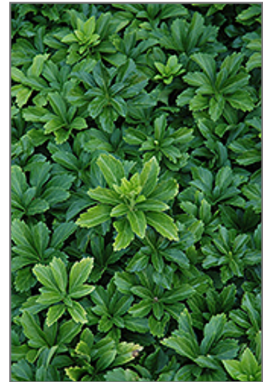
Green Sheen Japanese Spurge foliage