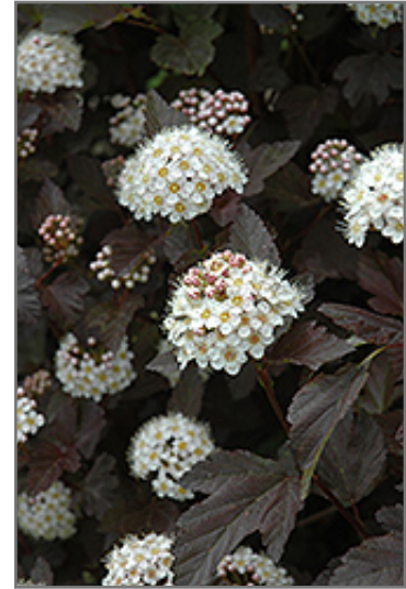
Diablo Ninebark flowers

Diablo Ninebark is recommended for the following landscape applications;